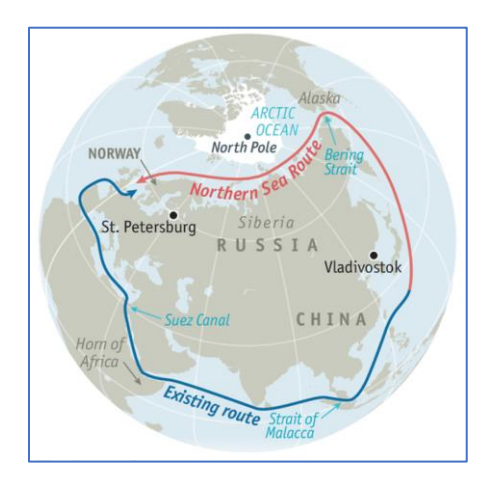
The Northern Sea Route (The Economist)

China is among the 13 accredited observers of the Arctic Council, including France, Germany, Italy, Japan, the Netherlands, Poland, India, South Korea, Singapore, Spain, Switzerland, and the UK.